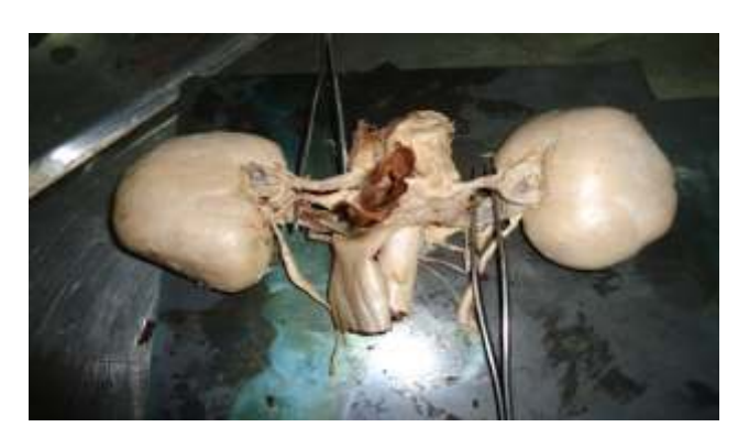
Fig. 01. Right kidney showing the presence of Accessory Renal Artery inferior to main Renal Artery.

RK=Right Kidney RA=Renal Artery ARA=Accessory Renal Artery